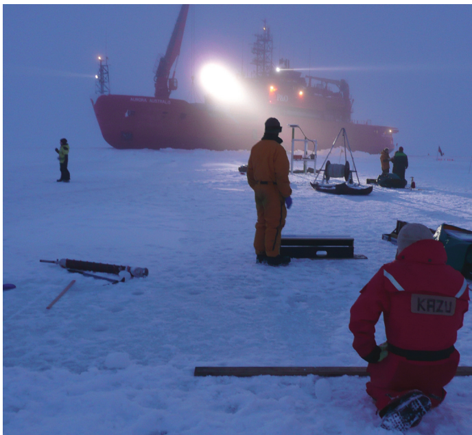
The icebreaker Aurora Australis in the late polar afternoon.